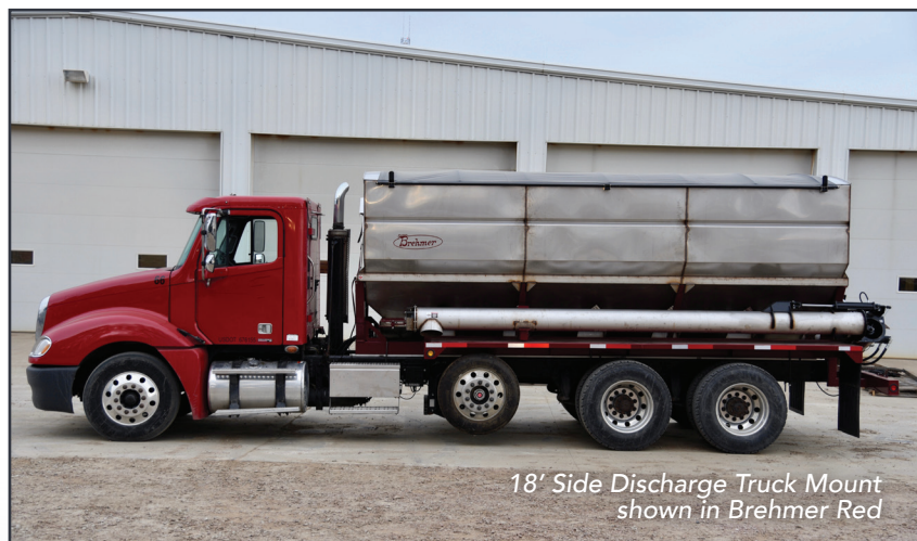
18' Side Discharge Truck Mount shown in Brehmer Red