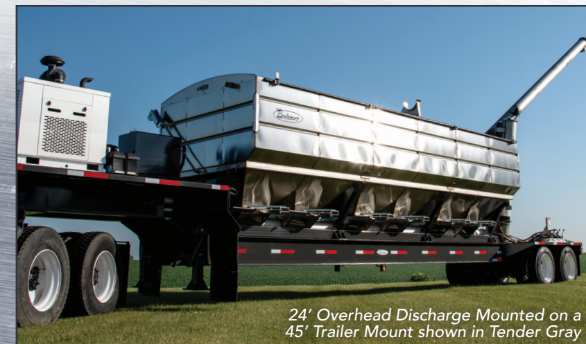
24' Overhead Discharge Mounted on a 45' Trailer Mount shown in Tender Gray