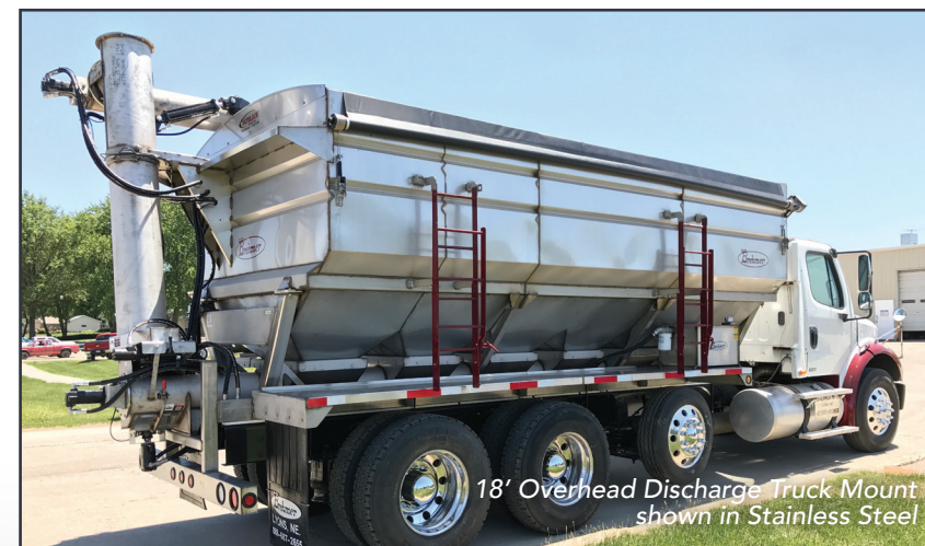
18' Overhead Discharge Truck Mount shown in Stainless Steel