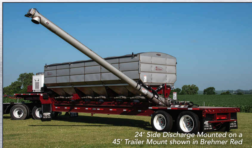
24' Side Discharge Mounted on a 45' Trailer Mount shown in Brehmer Red